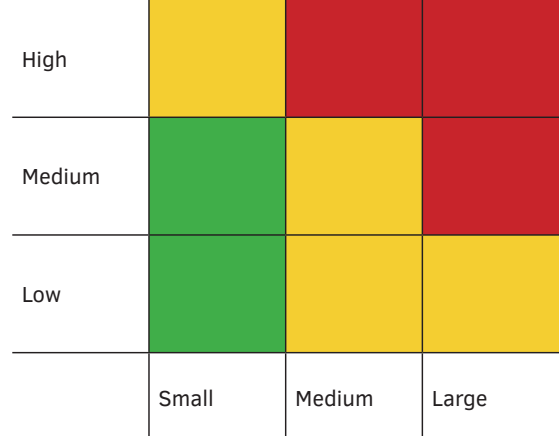
Fig. 1 Risk Matrix